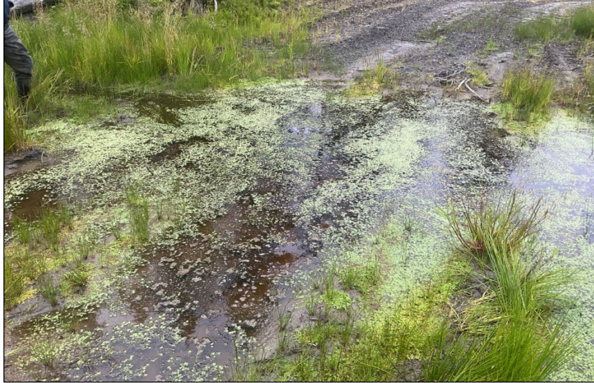
Figure 2.—Ponded water crossing the road at waypoint 760.