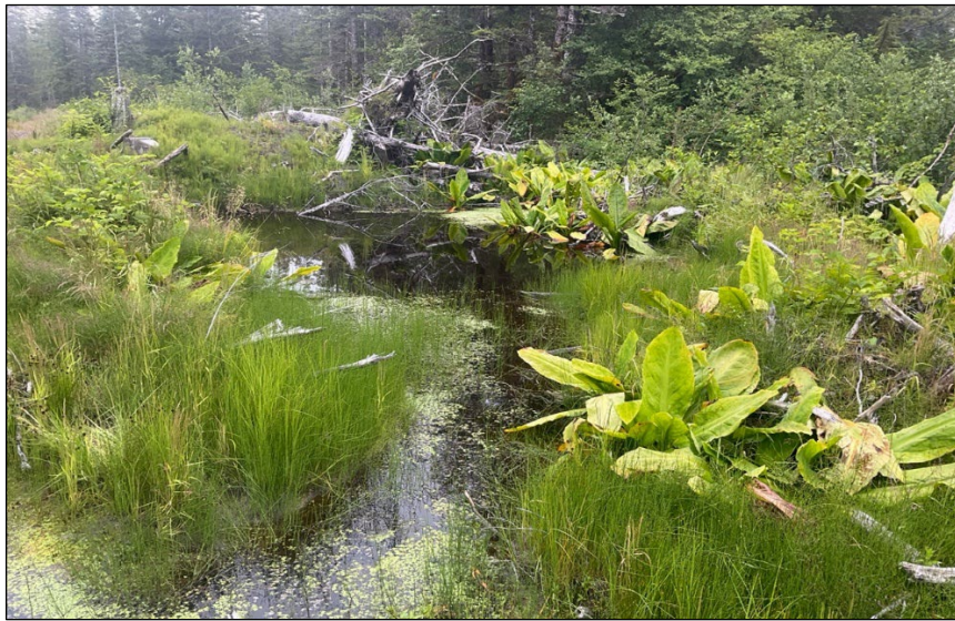
Figure 3.—Ponded water below the road at waypoint 760.