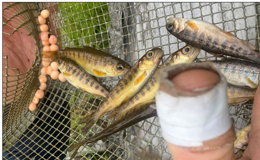
Figure 1.–Coho salmon caught above the road at waypoint 760.